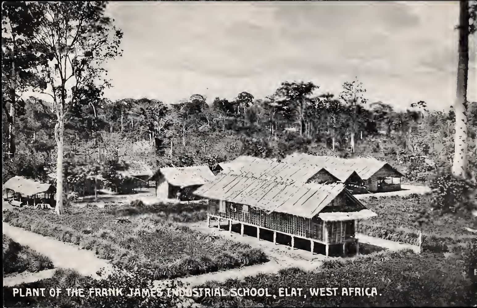
PLANT OF THE FRANK JAMES INDUSTRIAL SCHOOL, ELAT, WEST AFRICA.